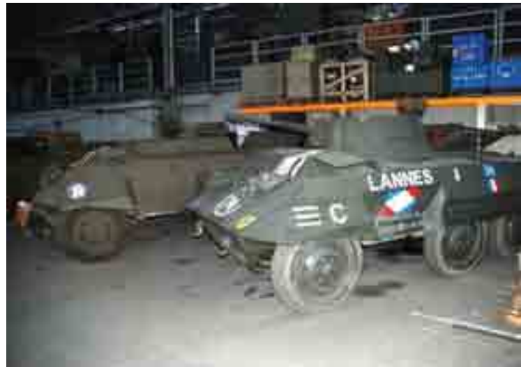
➤ US vehicles M8 and M20 recognition.