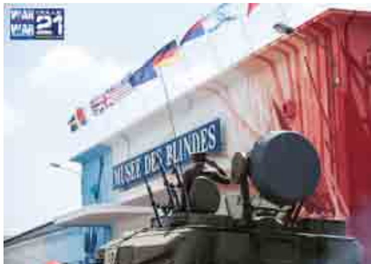
➤ ZSU-23-4 Shilka passing the museum entrance