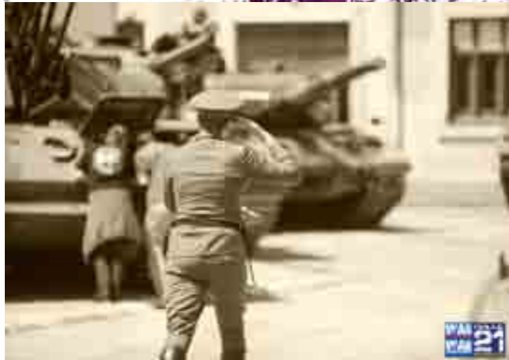
➤ «Russian officer « saluting the crews