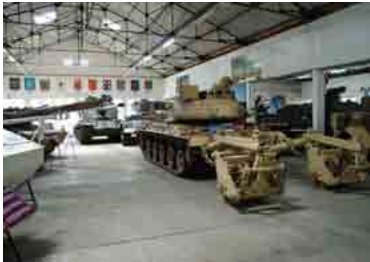
➤ Here is a AMX30 minesweeping vehicle, used in Iraq during the first Gulf War.