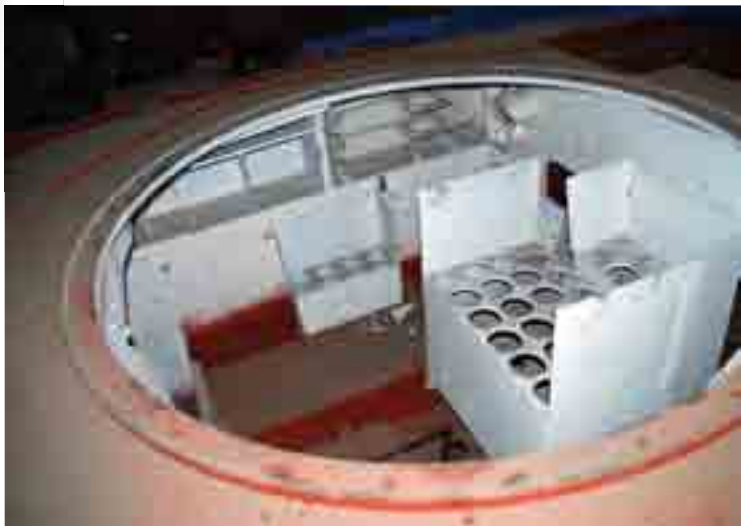
➤ The interior is perfect again.