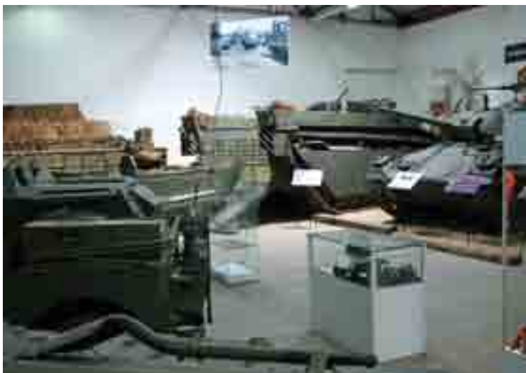
➤ The Indochina war is also covered, with vehicles that saw action during the conflict.