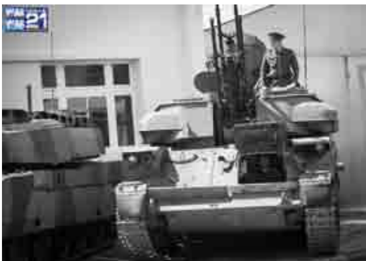
➤ Russian anti-aircraft self propelled gun ZSU-23-4 Shilka