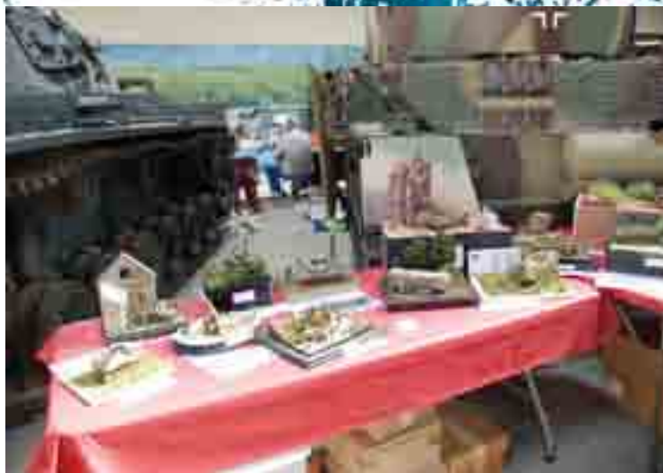
➤ Another view of the challenges tables organized by the Forum.