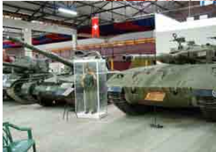
➤ The "Currently in Service Hall" with a Merkava.