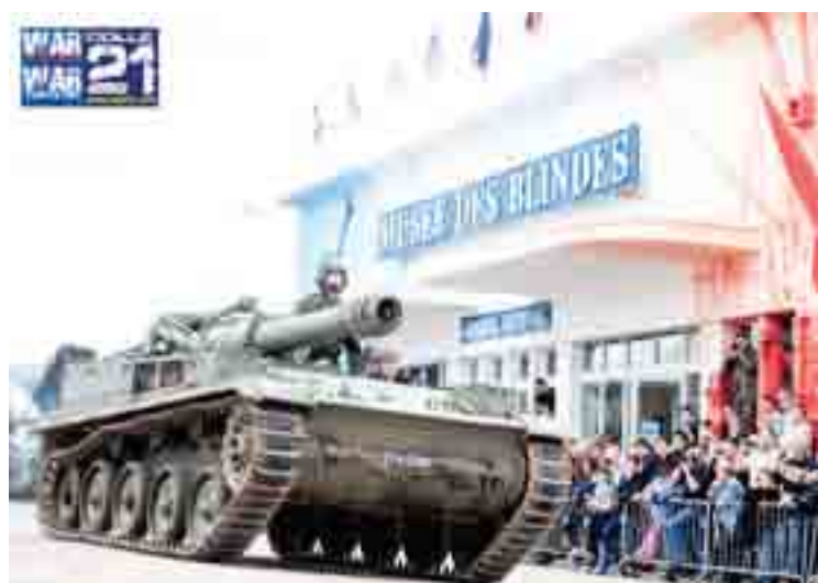
➤ AMX-13 155 F3 passing in front of the audience gathered for the event