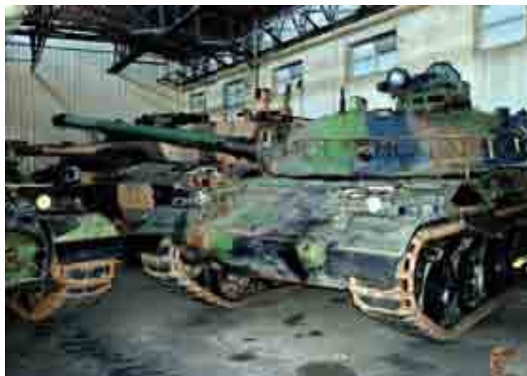
➤ Evolution of the French contemporary tanks from the AMX 30 to the AMX 40.