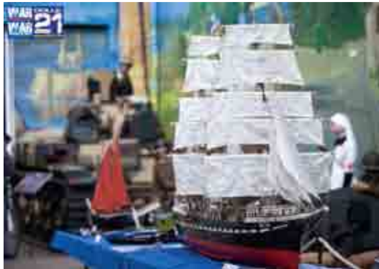
➤ Some rare but magnificent ships in the aisles.