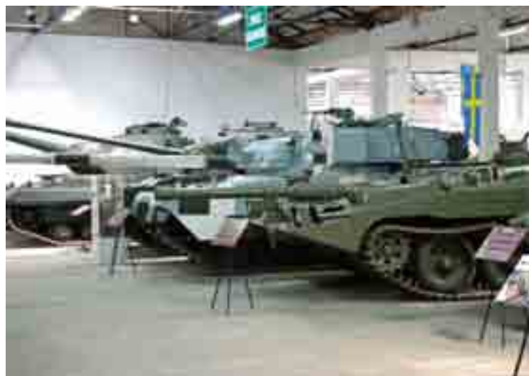
➤ All the nations, such as Great Britain and Sweden, are represented.