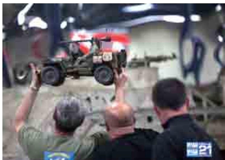
➤ The «big scales» were present too, here is a Jeep Willys