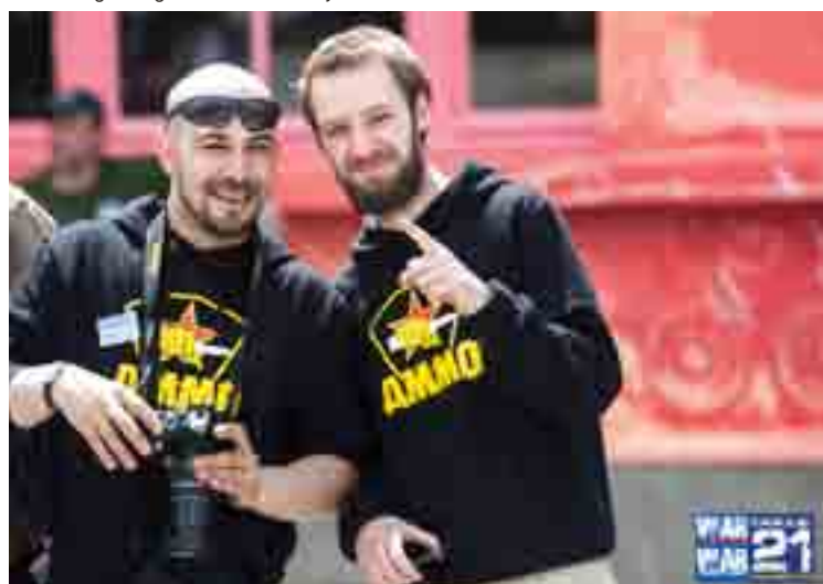
➤ Two happy modelers sporting the colors of our partner.