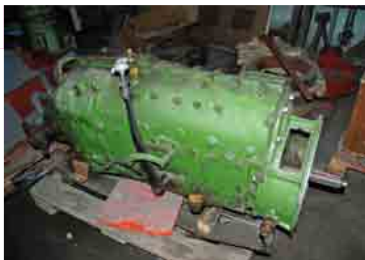
➤ The gear box displays its original green color.