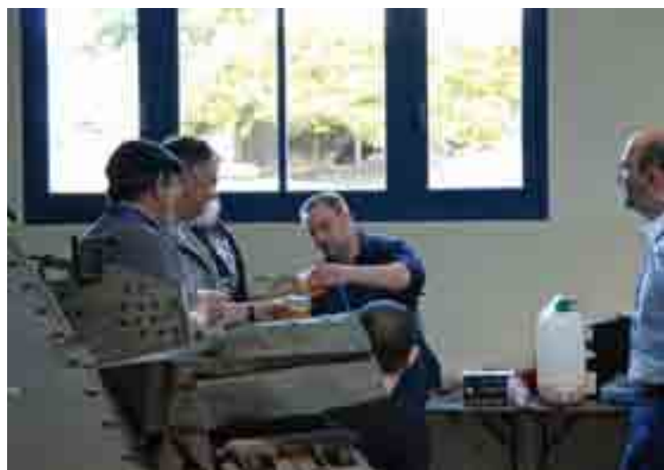
➤ Small drink between friends. Sharing and conviviality are omnipresent. To drink moderately of course!