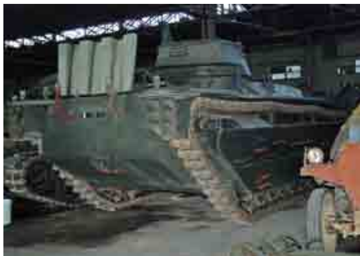
➤ A monstrous LVT Alligator!!