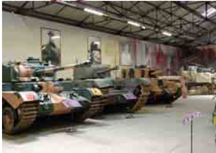
➤ The "Allies of the Second World War Hall".