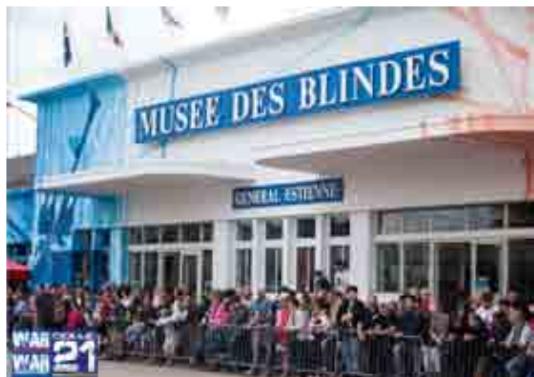
➤ The audience in front of the new (superb) façade of the museum