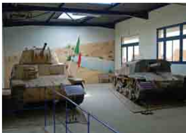
➤ The Italians tanks of the Second World War.