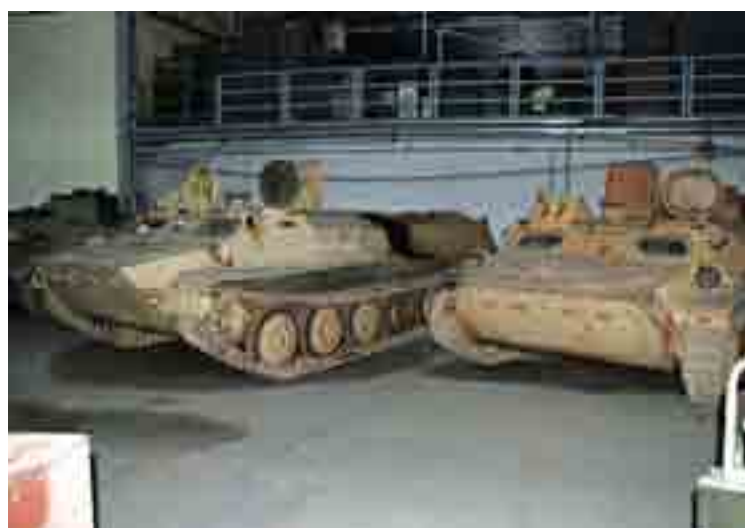
➤ Russian made vehicle retrieved by the French Army during the Gulf War 1.