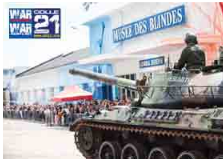
➤ AMX-30 ready to parade