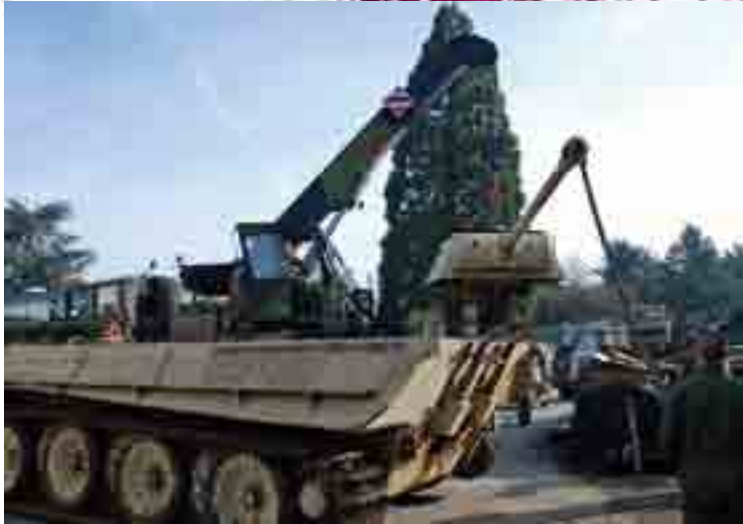
➤ The heavy operations, like the turret removal, remain in the hands of the Armor school professional mechanics.