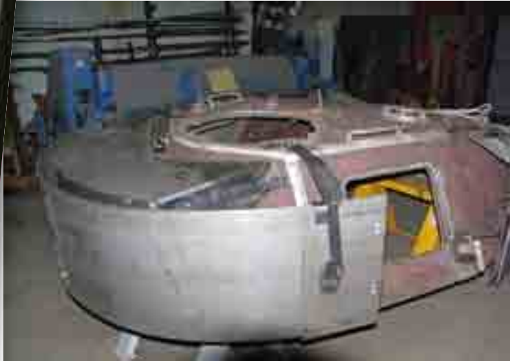
➤ The turret was totally sanded...