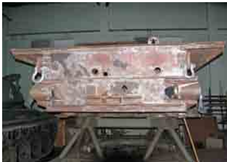
➤ The hull is sanded to start from a clean base.