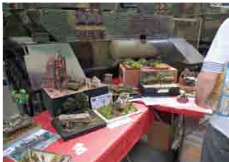
➤ In the foreground, a view of the models of Laurent (S.Tank) and Gilles (Lostiznaos) for whom the challenge was to make a Saint Chamond.