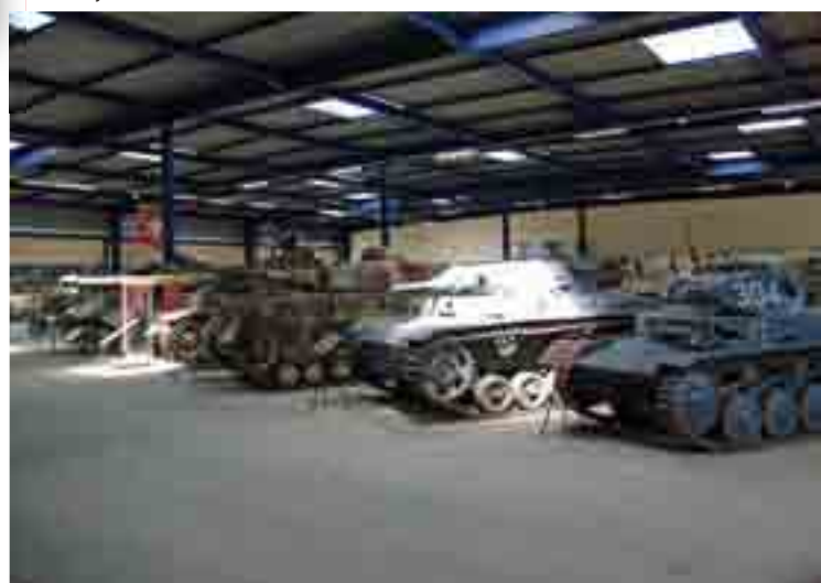
➤ The Panzer family, almost in its entirety: the Panzer II, III, IV, the Tiger I, the Tiger II, not forgetting the Panther.