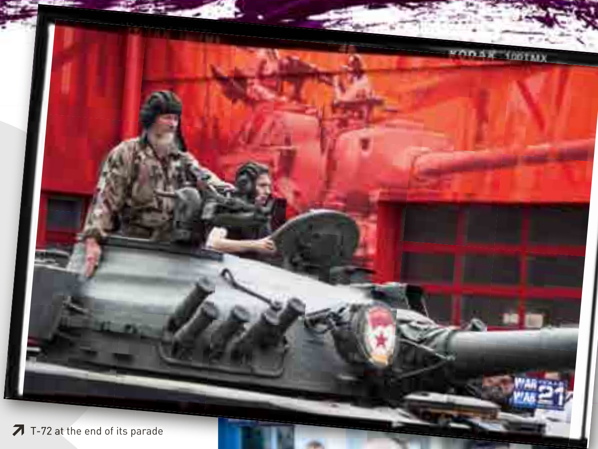
➤ T-72 at the end of its parade