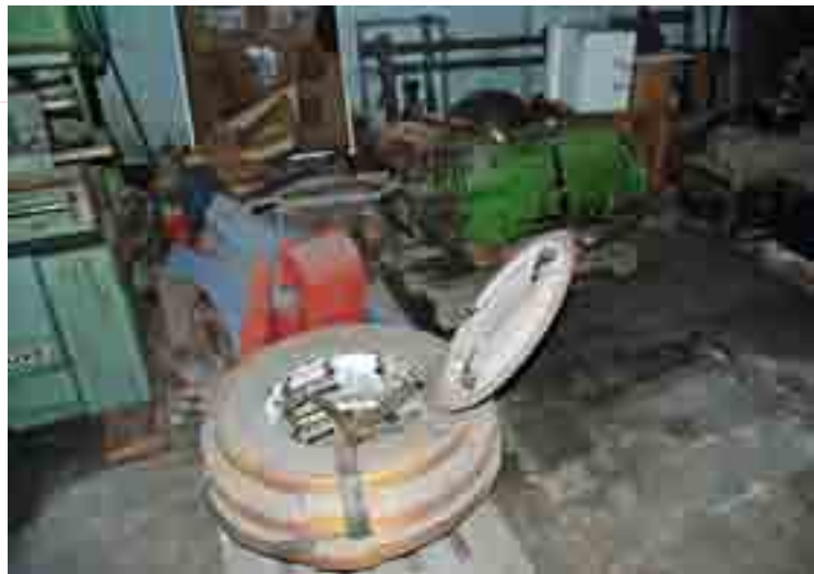
➤ Each part is inventoried and checked prior to being installed on to the tank.