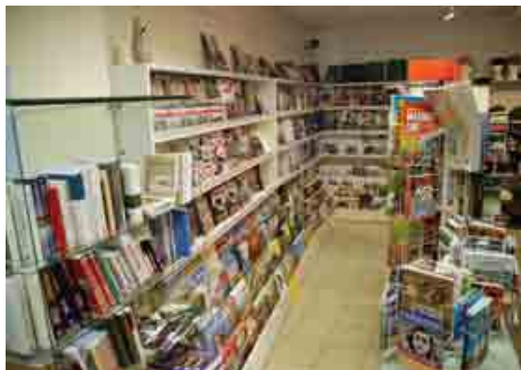
➤ The tour ends in the museum shop which offers numerous books and documentation about AFV.