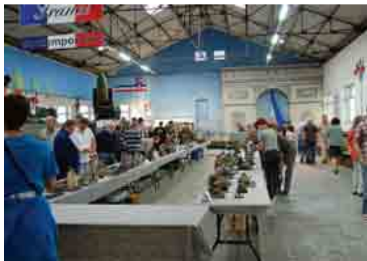
➤ The contest takes place in the room « France contemporaine ». The tables are getting covered little by little.