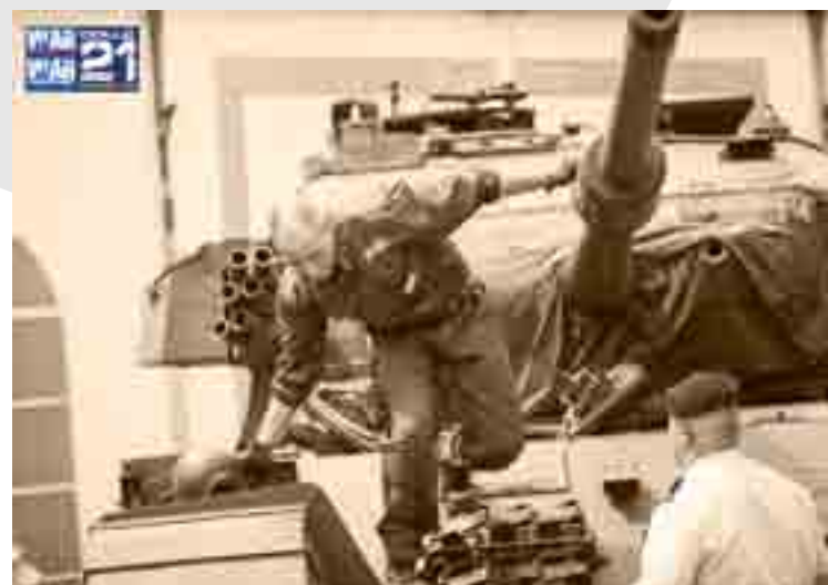
➤ British Centurion Mk.5 tank