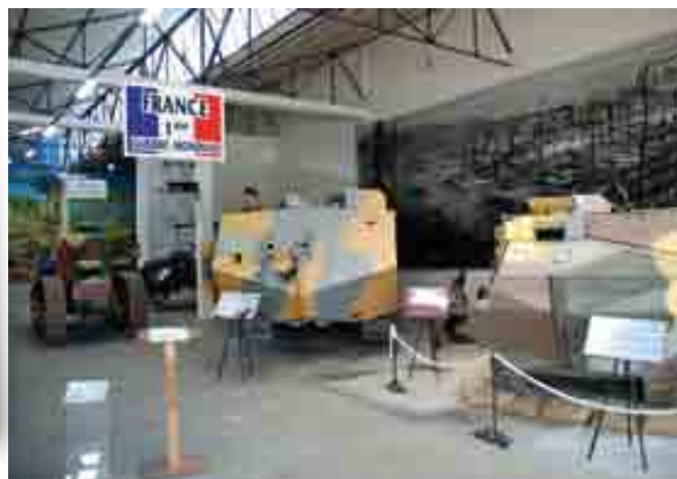
➔ The history of the tank started during the First World War. Here you can see a unique display comprising of a Renault FT17, a Saint-Chamond and a Schneider.