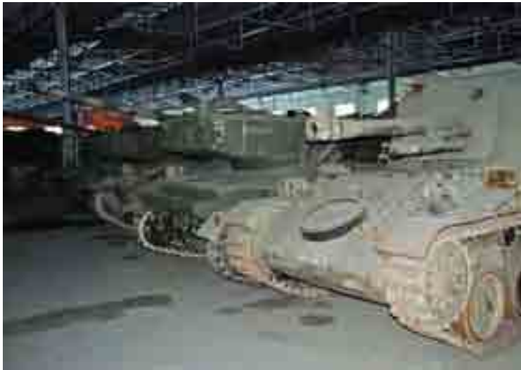
➤ Other variants of the AMX 13.