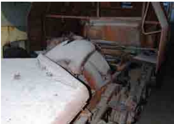
➤ Right view on the inside of 7/1 Sd.Kfz.