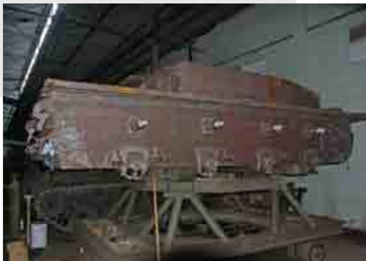
➤ The vehicle is totally stripped down.