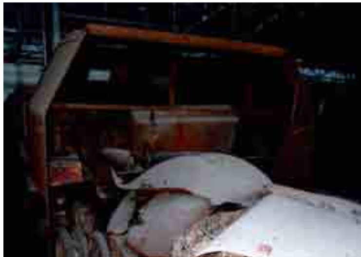
➤ Left view this time on the inside of the Sd.Kfz 7/1. The conclusion is that the future restoration work is huge.