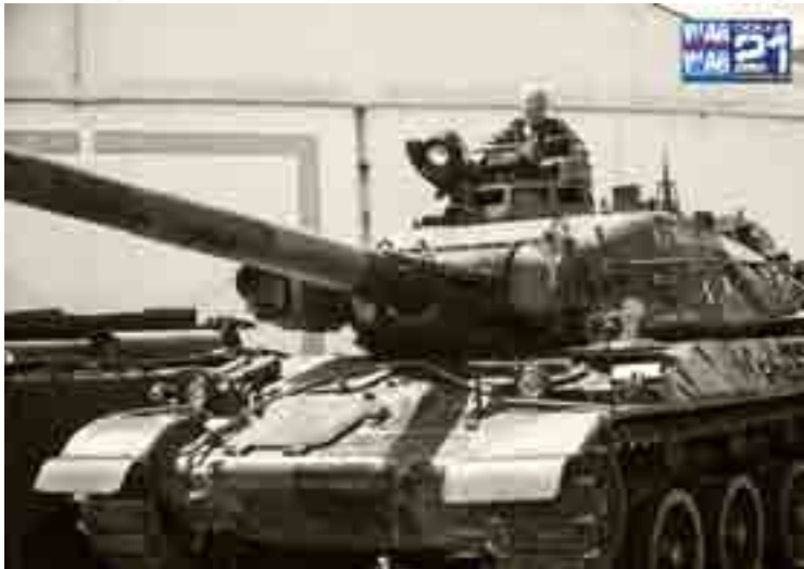
➤ French AMX-30 B2 tank