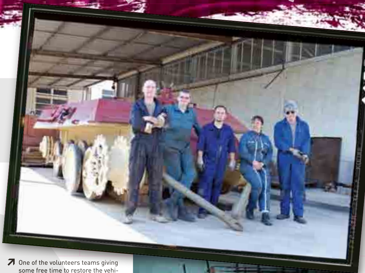
➤ One of the volunteers teams giving some free time to restore the vehicles of the museum.