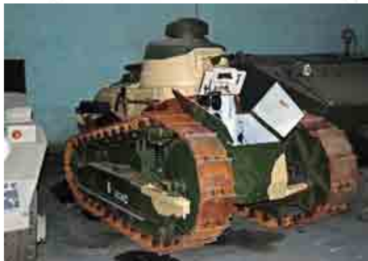
➤ Here is one of the FT 17 in perfect working condition.