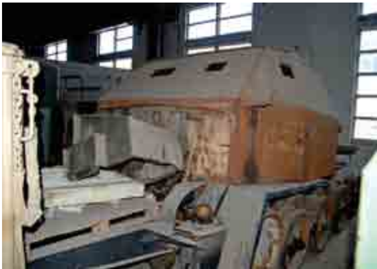
➤ Another treasure, a SdKfz 7/1 with an armored cab.