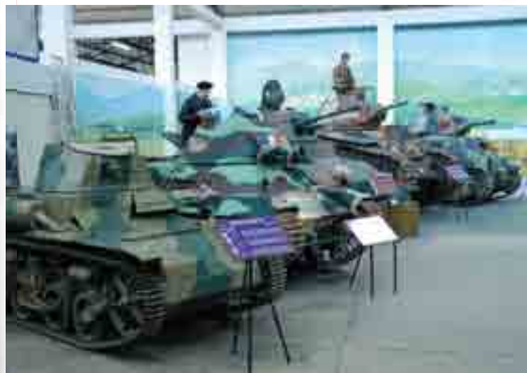
➤ The "France 40 Hall" exhibits French armoured vehicles, that fought the early battles of the Second World War.