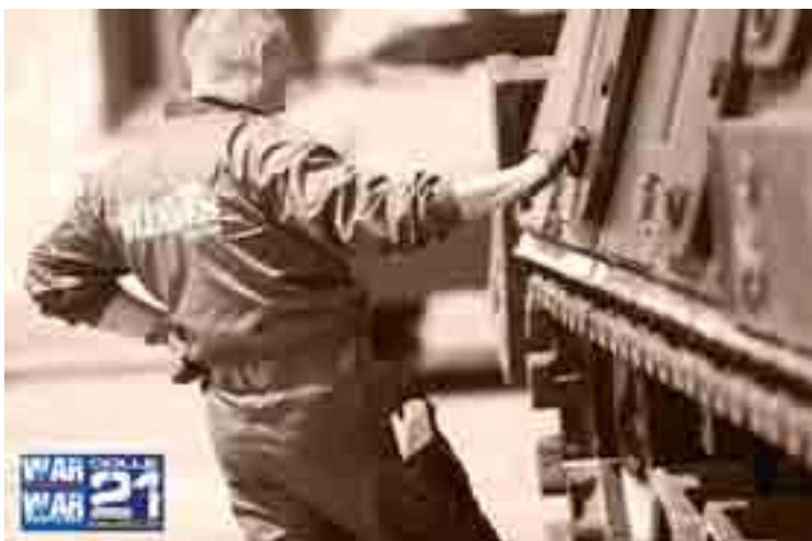
➤ Ultimate inspection of the French DCL recovery tank before the parade