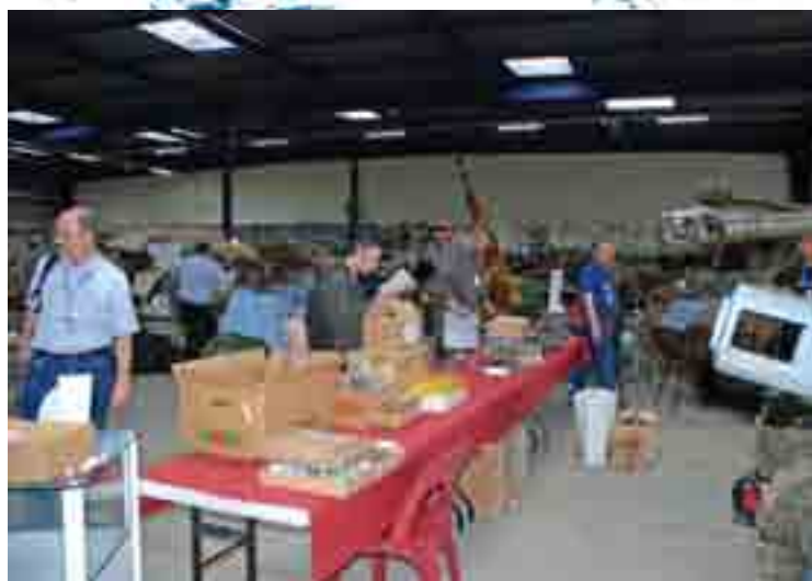
➤ Sunday evening, already the end of the week-end. It is time to pack up the stand. It went way too fast. Now we give you rendezvous for the 30th edition of the Saumur tank museum international model contest.