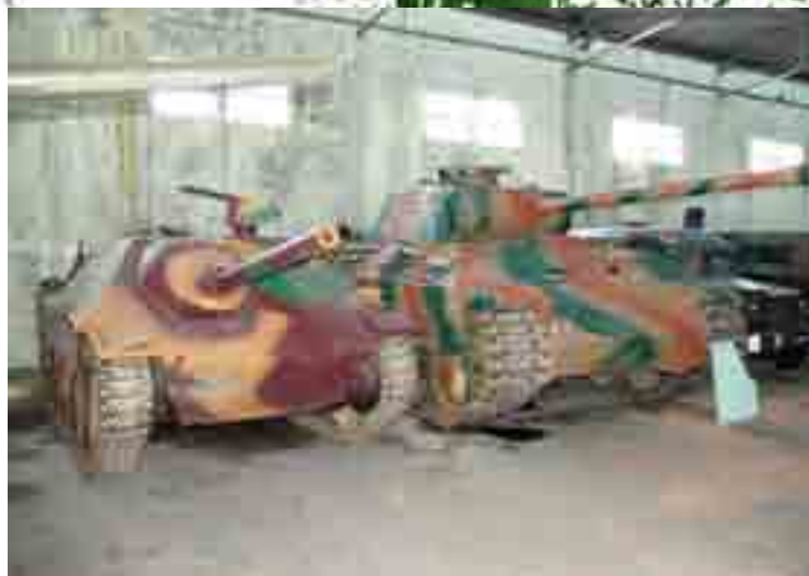
➤ The rolling Hetzer and Panther ausf.A.