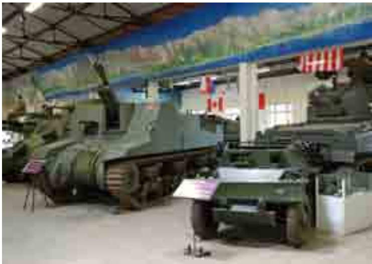
➤ From tracked artillery to wheeled light armoured vehicles. The collection is one of the extensive of its kind.