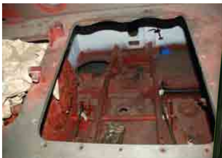
➤ The location of the transmission block that is being restored.