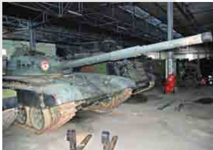
➤ A Russian monster, the T72.