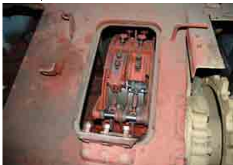
➤ The steering brake system has been checked and settled back in place.