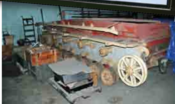
➤ The Panzer IV project is huge substantial. This tank will be restored to working condition.

The saving of vehicles is an absolute priority of the tank museum. The restoration of a tank can last several years but the result is worth it. Here are some examples of restoration achieved by the mechanics of the workshop with the help of volunteers.