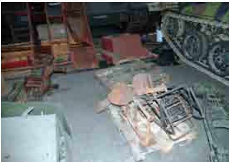
➤ The turret parts are gathered before being cleaned one after another.