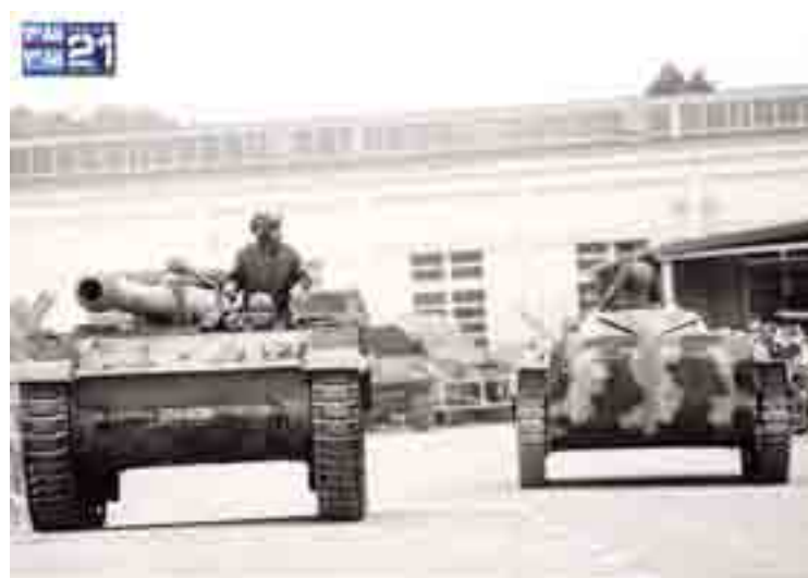
➤ BMP-1 (rear view) passing the French AMX-13 155 F3 self-propelled gun