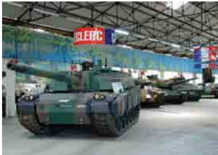
➤ The "French Hall" holds modern, currently in use, French vehicles.