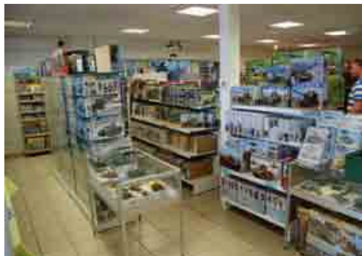
➤ Many model kits are also for sale.