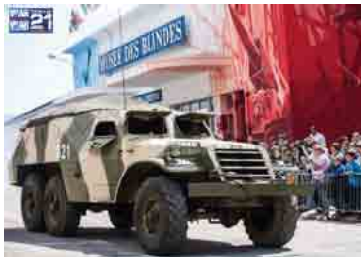
➤ BTR-152 heading back to the garages