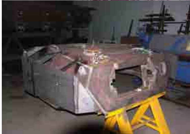
➤ ...then got its new « Schürzen ».