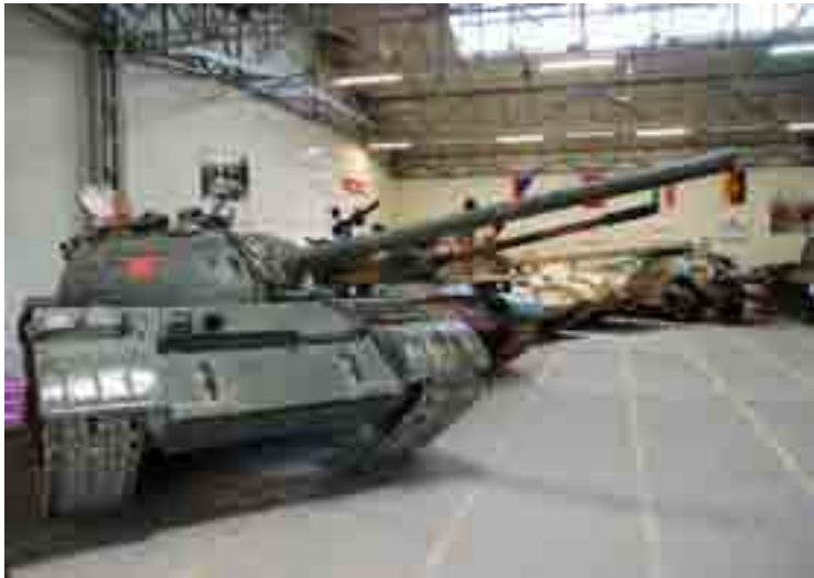
➤ The "Warsaw Pact Hall".