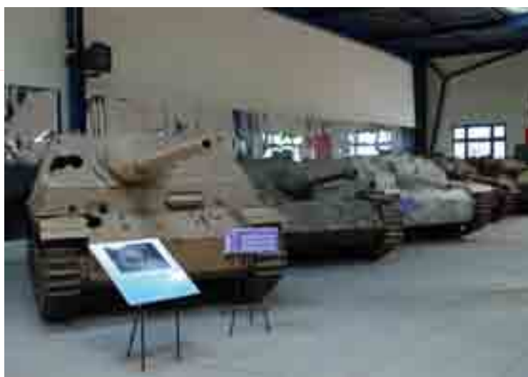
➤ The great exhibits of the "German Hall" make it the most impressive anyone can find.