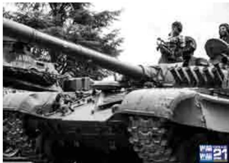
➤ Russian T-72 tank