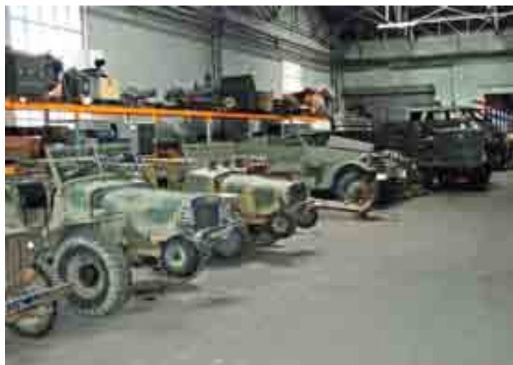
➤ Even though they are not tracked vehicles, these wheeled vehicles deserve their place in the museum considering their rarity. They are often used during the Saumur Carrousel.