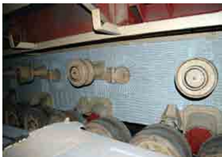
➤ After having been totally stripped down, the tank got its Zimmerit coating again. The latter is made of tile cement.