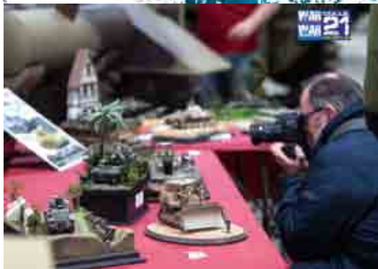
➤ A part of the "Warpaints" stand, in the foreground from left to right: Renault D2 (Navy) - M551 Sheridan (Diablu) - Dozer D9R (Thierry33).