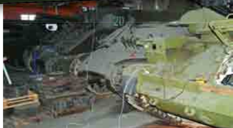
➤ The vehicles are maintained in working condition. Despite the dust, they benefit from a perfect restoration.

The reserves are full of restored vehicles in working condition but also of others waiting for being restored. This part of the museum is not open to public, unless during the model show when guided tours are organized.