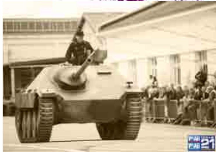
➤ German tank destroyer Jgpz. 38(t) Hetzer