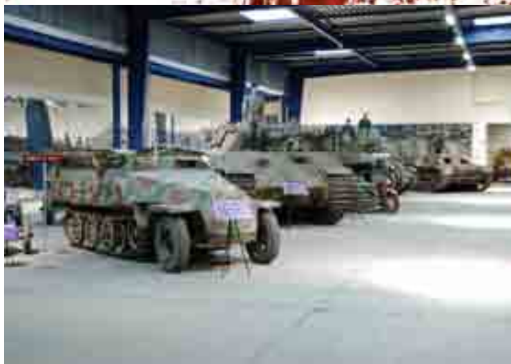
➤ The "World War Two German" Hall holds one of the finest collection of its kind.