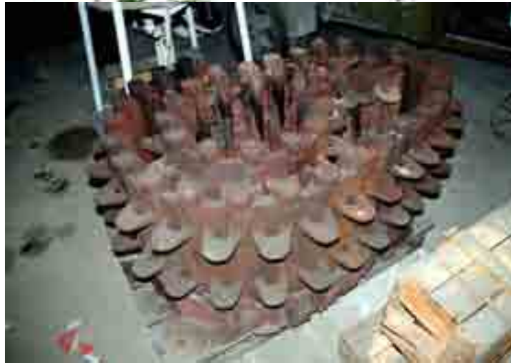
➤ A true treasure, the combat tracks of the Tiger 1.