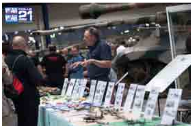
➤ The « wingies fans » although being a minority were nonetheless worthily represented.