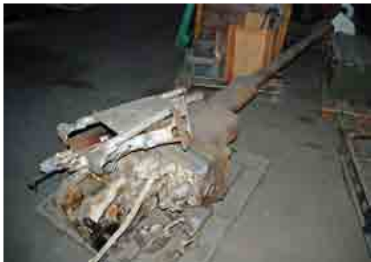
➤ The 7,5cm gun of the Panzer IV.