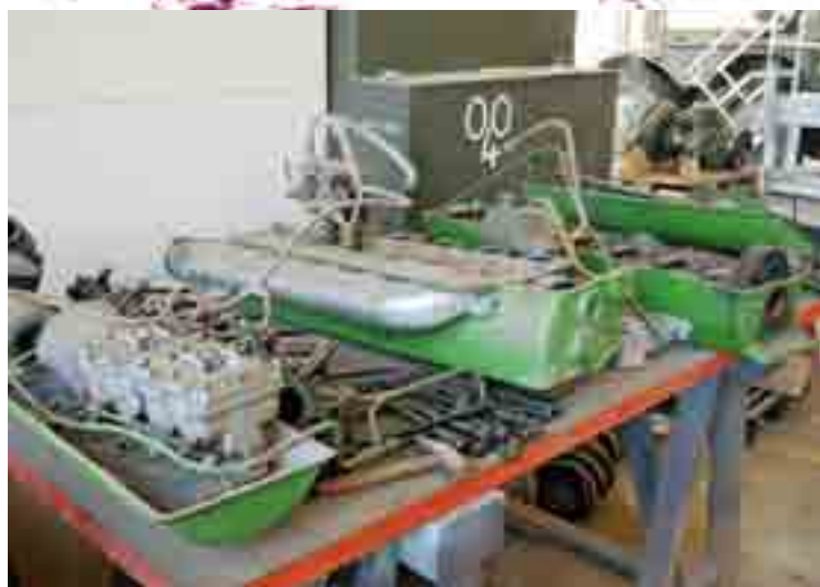
➤ The ventilators of the engine are fixed on the ventilation grille.