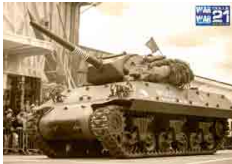
➤ TD M10 «Sirocco» of the RBFM of the 2nd French AD