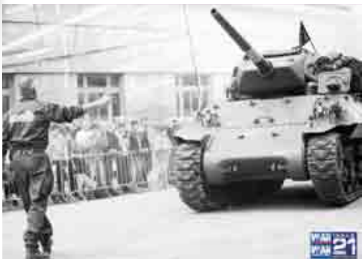
➤ US tank destroyer M10 GMC