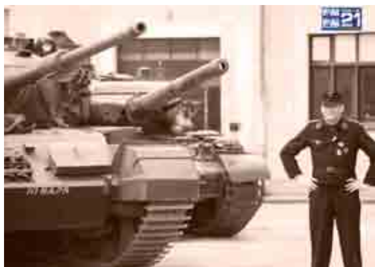
➤ José Duquesne wearing a Wehrmacht armored troops uniform is posing in front of the Centurion and the AMX-30