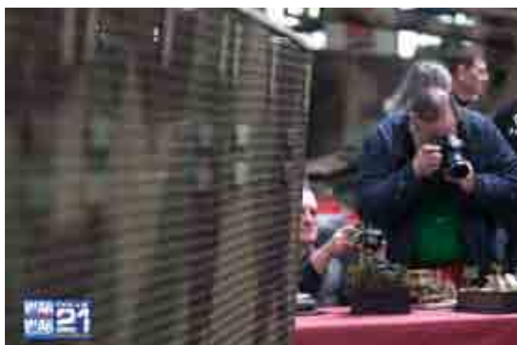
➤ Some curious visitors and fans too at the "Warpaints" stand next to the Panzer IV ausf J.