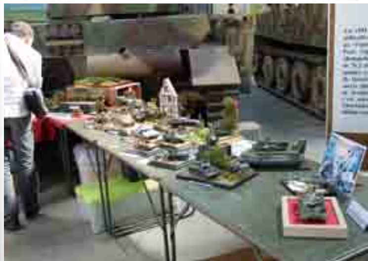
➤ Another exhibition zone of the stand is dedicated to the forum « challenges ». All the models will then take part in the contest.