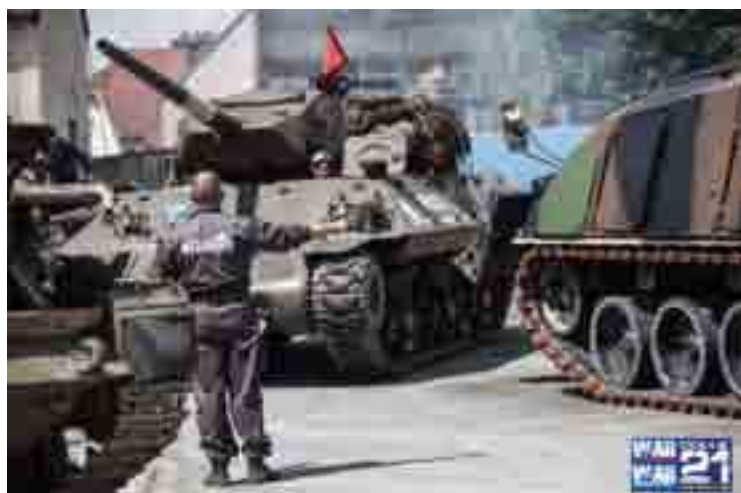
➤ TD M10 moving in front of the Leclerc DCL