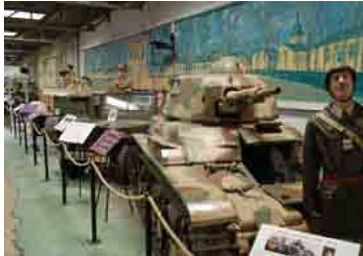
➤ The "Hall of the Great Men".