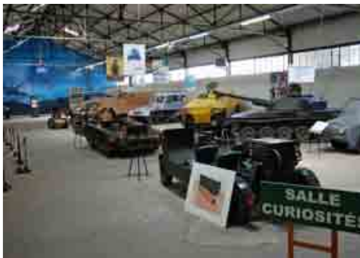
➤ The "Hall of Curiosities"