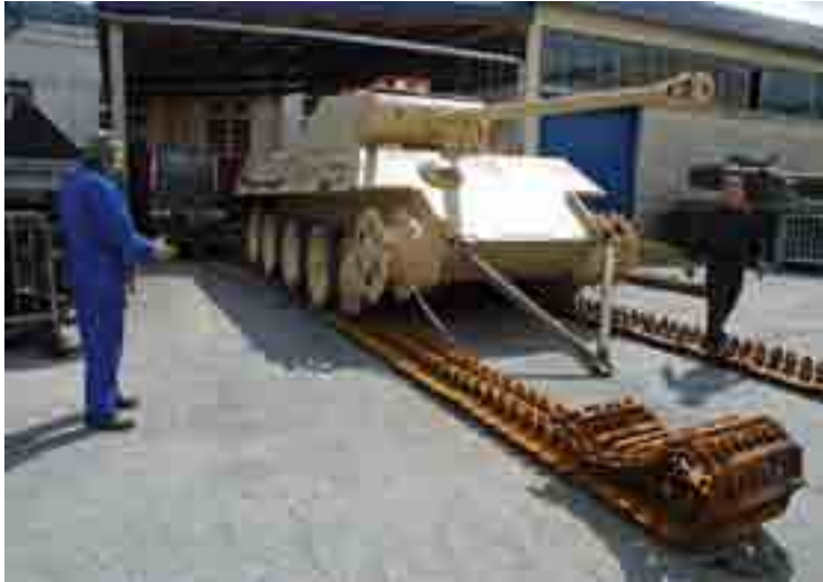
➤ Another huge project, the Panther ausf G.