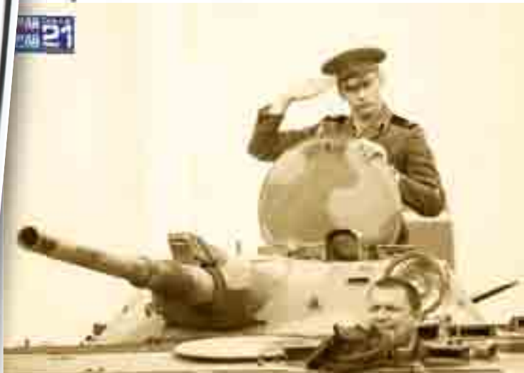
➤ Russian armored infantry fighting vehicle BMP-1