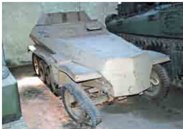
➤ The SdKfz 250 drove back in the reserves. It was replaced by the Panzer I lent by the Munster museum.