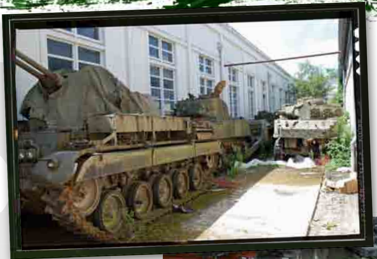
➤ Many vehicles are stocked outside waiting for their restoration.