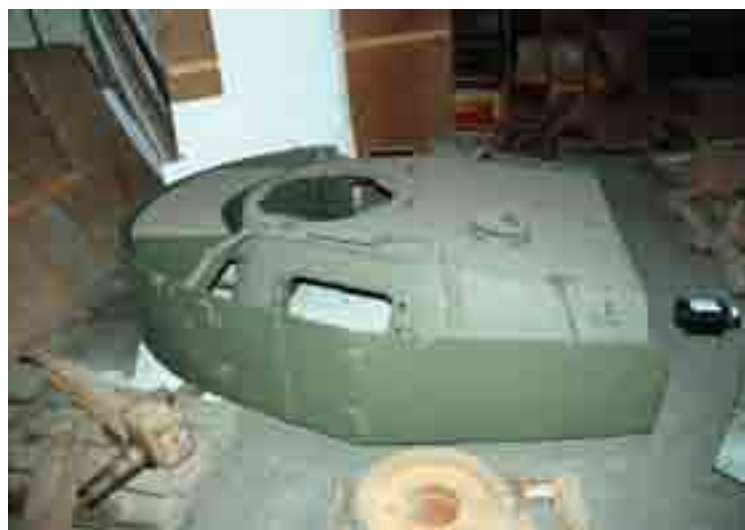
➤ The turret is painted with a green anti rust paint. The « Schürzen » have been fully rebuilt.