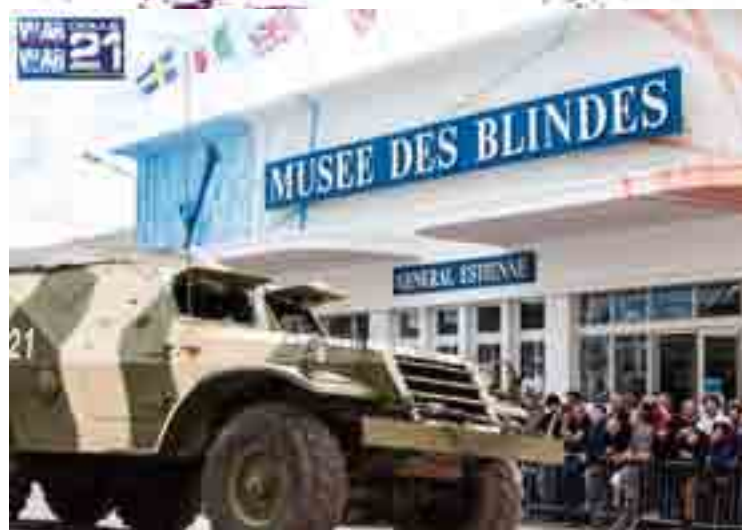
➤ BTR-152 in front of the new museum façade