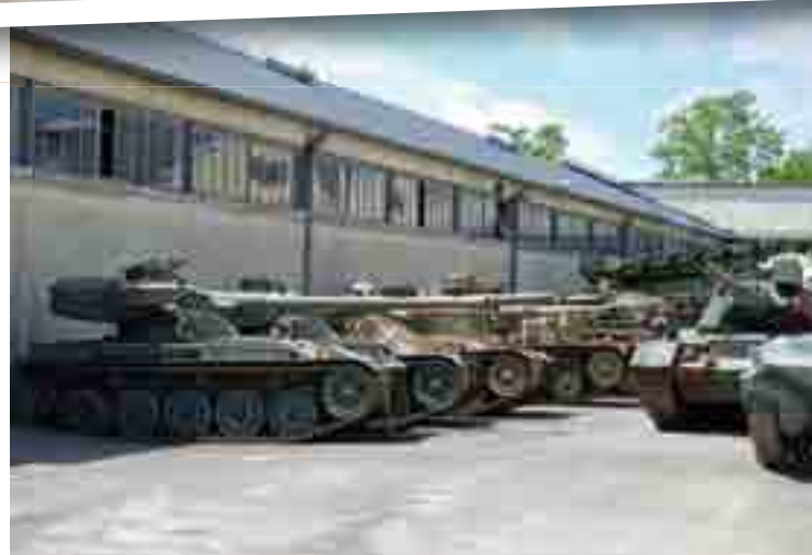
➔ Outside, you will find a display of the AMX13 "family".