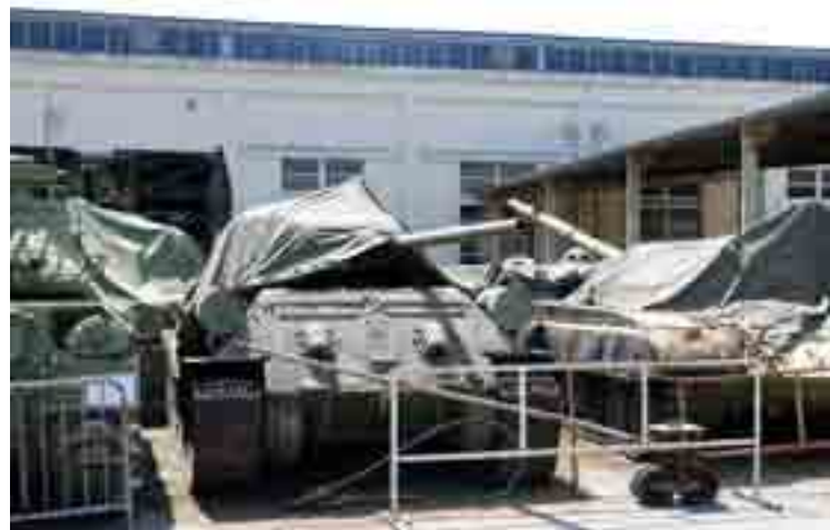
➤ The visit ends in the Museum Shop where you will find many books and resources regarding armoured fighting vehicles.